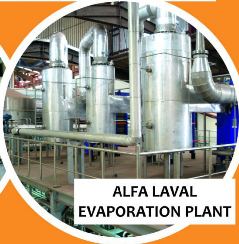
ALFA LAVAL EVAPORATION PLANT